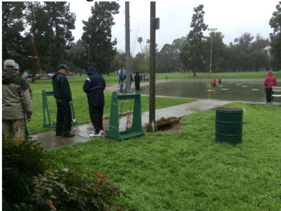
View of the casting ponds (Saturday)