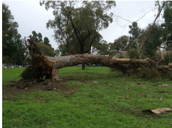
Eucalyptus tree next to LBCC clubhouse